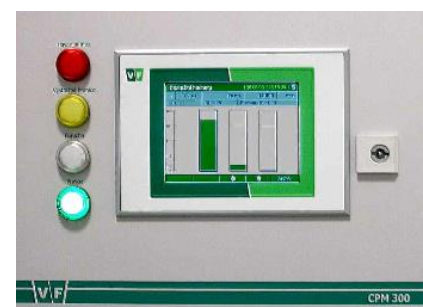
PLC screen and visual indication

Electromagnetic compatibility (EMC) EN 55022, EN 61000-6-144, EN 61326-1