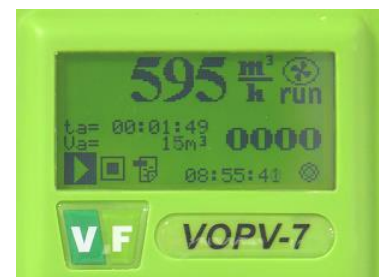
The display of VOPV-7 air sampler